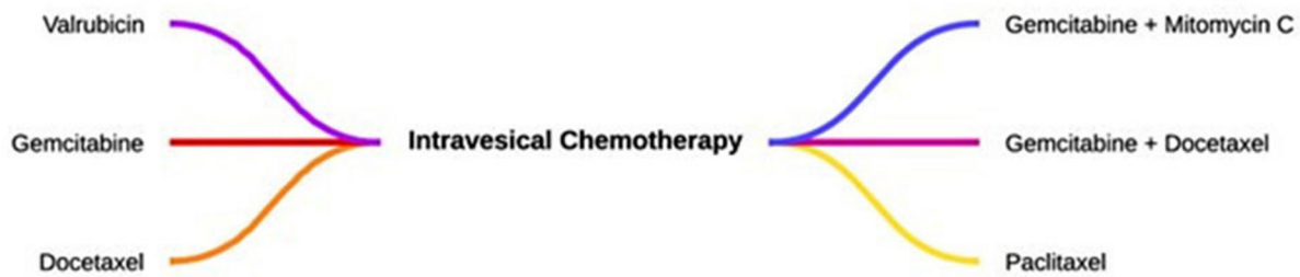
Figure 2. Intravesical chemotherapy drugs and their combinations approved or are currently being studied in bladder cancer.