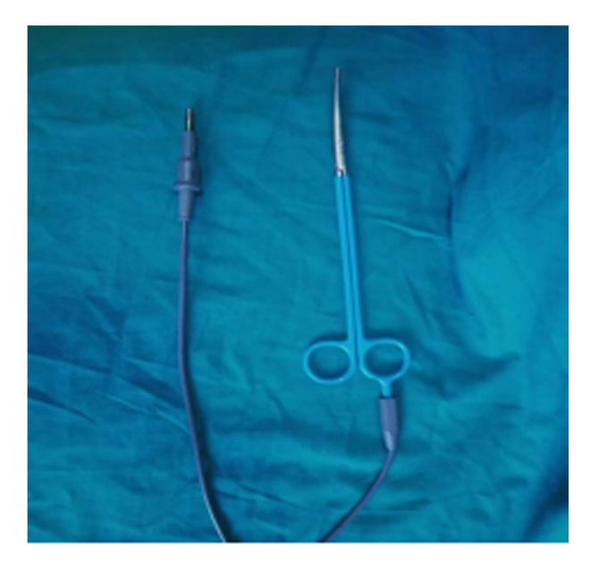
Figure 2. Electro-thermal scissor.

study in which LN dissection was carried out up to the inferior mesenteric artery, showed that the prognosis of extrapelvic nodal disease is dismal. So, the usefulness of routine superextended LN dissection is questionable [21-22]. Moreover, to increase the yield of LNs, lymphatic tissues should be sent in separate submissions for pathologic evaluation [23].