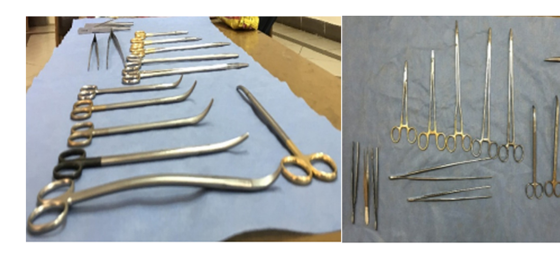
Figure 3. Surgical tray showing instruments of different lengths and curves.

The importance of minimally invasive laparoscopic and robotic