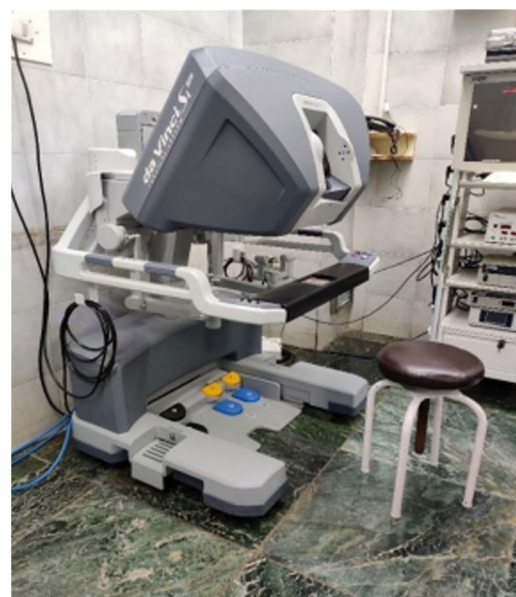
Figure 2. Operating surgeon console of the da Vinci Robot.