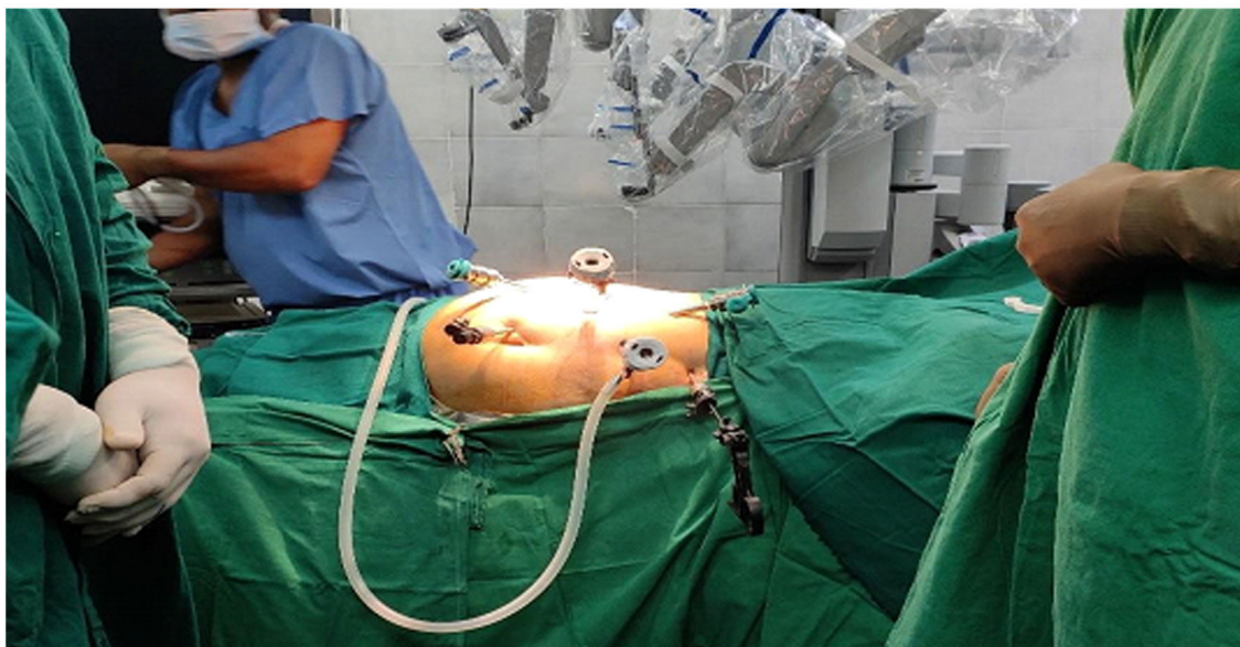
Figure 3. Normal placement of the laparoscopic assistant and Robotic ports for right RAPN.

and surgical specimen taken and sent in the designated laboratory to designated experts. The surgical pathology reports and the margin clearance were collected prospectively. Data thus collected recorded on pre-designed semi-structured study proforma.