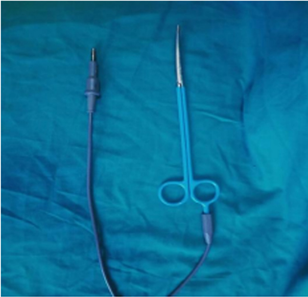
Figure 2. Electro-thermal scissor.

study in which LN dissection was carried out up to the inferior mesenteric artery, showed that the prognosis of extrapelvic nodal disease is dismal. So, the usefulness of routine superextended LN dissection is questionable [21-22]. Moreover, to increase the yield of LNs, lymphatic tissues should be sent in separate submissions for pathologic evaluation [23].