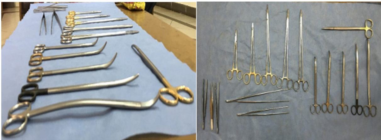
Figure 3. Surgical tray showing instruments of different lengths and curves.

The importance of minimally invasive laparoscopic and robotic